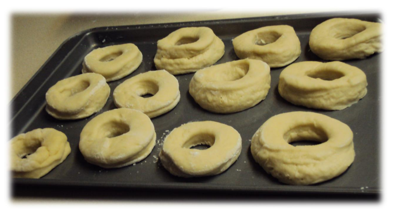
Consequently, timers were set for 2:00, 3:00 and 4:00 (AS IN AM) complying with the handling of her yeast recipes; meaning: