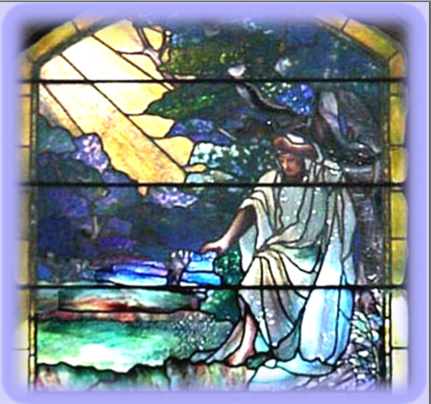
"THY WILL BE DONE" stained glass window by Tiffany Studios

(Courtesy of Brown Memorial Park Avenue Presbyterian Church, Baltimore, Maryland)