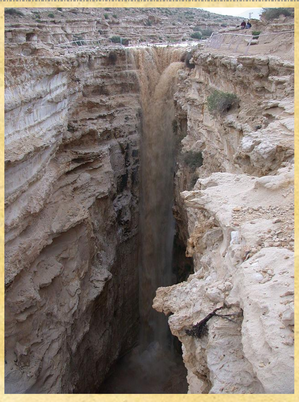
"Ein Avdat Flood 1" by Gideon Pisanty (Gidip) - פיזנטי גדעון - Own work. Licensed under CC BY 3.0 via Wikimedia Commons -