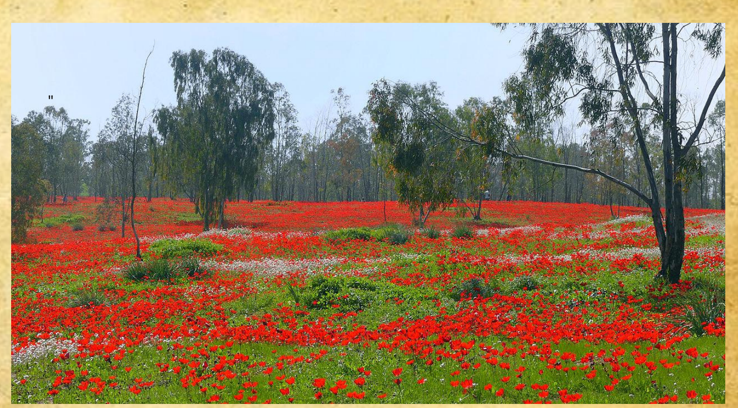
Red carpet of <u>Anemone coronaria</u> flowers in Shokeda forest, <u>Israel</u> (Zachi Evenor)