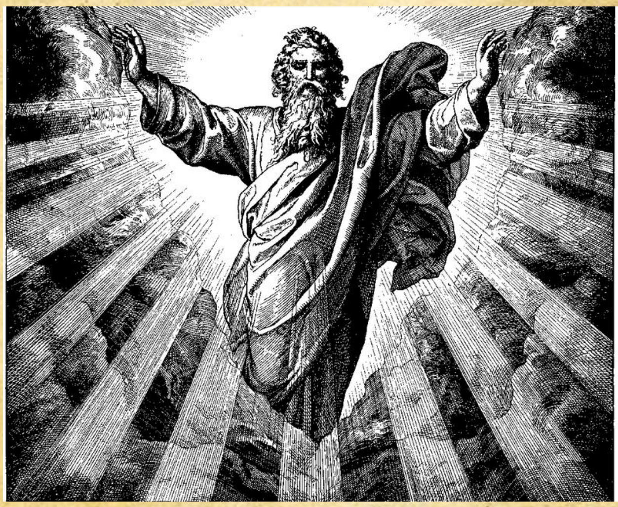
"Schnorr von Carolsfeld Bibel in Bildern 1860 001" by Julius Schnorr von Carolsfeld - Bibel in Bildern. Licensed under Public Domain via Commons -

For My thoughts are not your thoughts, Nor are your ways My ways," declares the LORD. <u>9</u>"For as the heavens are higher than the earth, So are My ways higher than your ways And My thoughts than your thoughts....Isaiah 55: 8-9 (NIV)