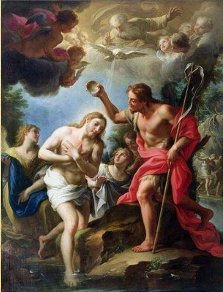
"Trevisani baptism christ"

Also, looking closely at the words John spoke when he saw Jesus shows the providence of God going even deeper. Although John would have probably been so familiar with the Book of Isaiah that he had committed it to memory, thus, being aware of the prophesy about the awaited Messiah, there still would have been no reason for him to identify Jesus as "THE LAMB OF GOD," unless arranged by God, himself. This, folks, is a moment of enlightenment!