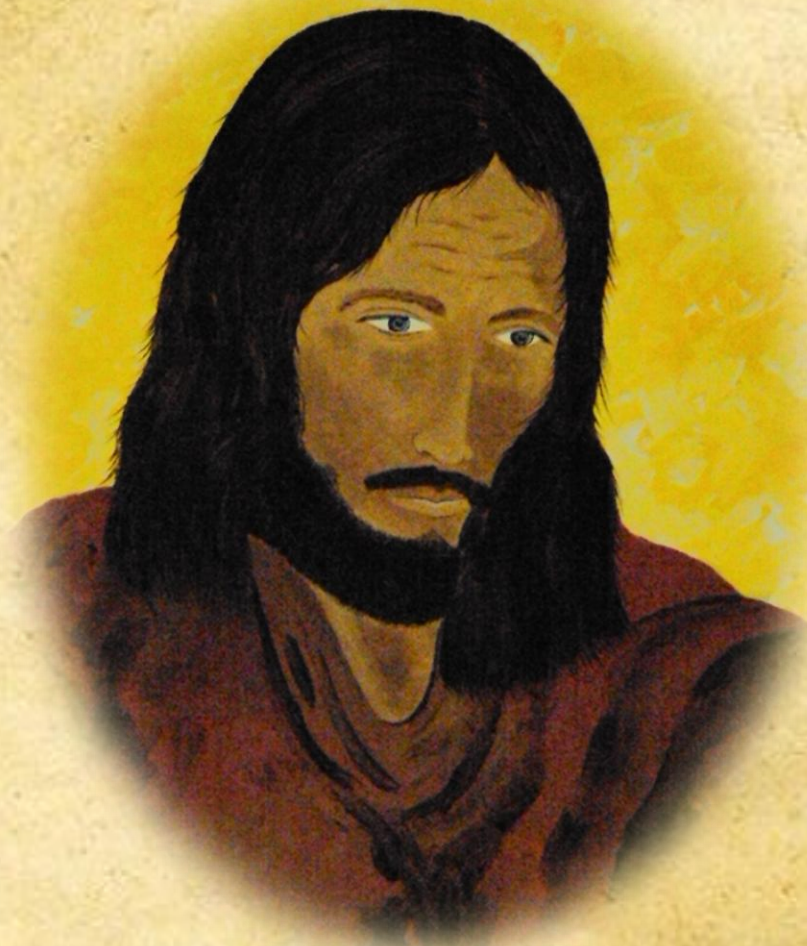
Painting of "Jesus, Man of Sorrow," from the United Methodist Church, Mountain Grove, Missouri