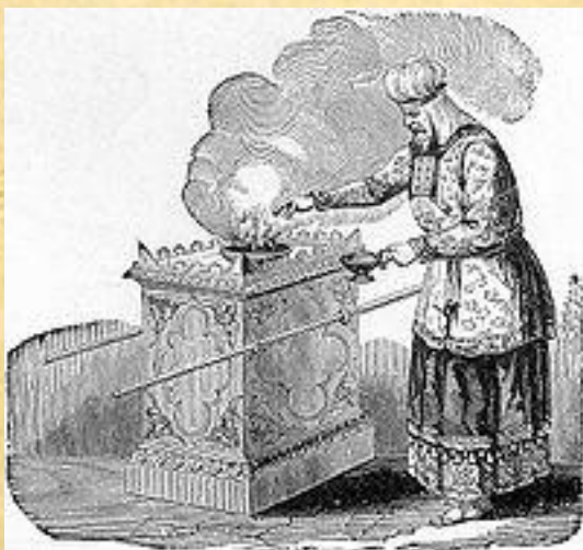
High Priest Offering Incense on the Altar (illustration from the 1894 Treasures of the Bible)

Therefore, when God made a covenant with the Israelites that they were to become his chosen people, he intended them to be a witness to others. In other words, they were blessed to be a blessing to others; a concept they did not understand. Instead, their feelings translated into that of exclusivity rather than inclusivity. (Be careful about pointing judgmental fingers in their direction regarding this attitude. That same danger exists today in churches, as well.) As a result, no matter how many times they sacrificed animals on the altar seeking God's forgiveness, or how often God saved them from total destruction as a people, the Old Testament is replete with circumstances describing them repeatedly falling away from God due to sinful actions and disobedience.