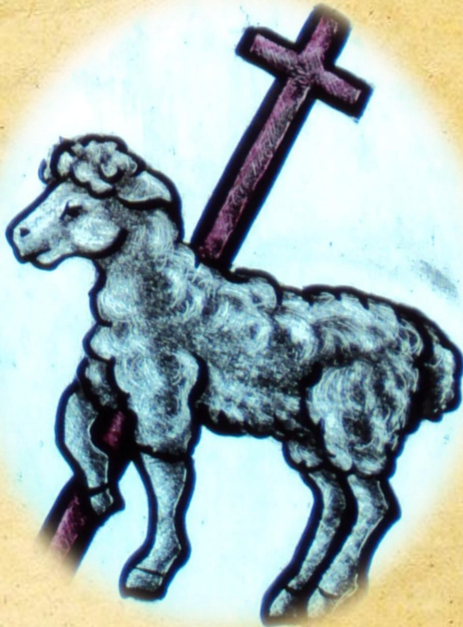
"Paschal Lamb" stained glass window courtesy of University Hts. Baptist Church Springfield, Mo.